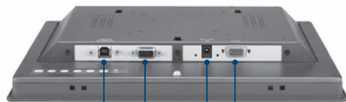
Touch Screen (USB) Touch Screen (RS-232) DC Jack 12V DC (100-240V AC adapter included) VGA Port