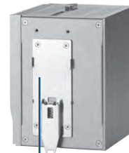
Din-rail kit ▲ Rear view