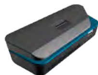
Combo Card Reader