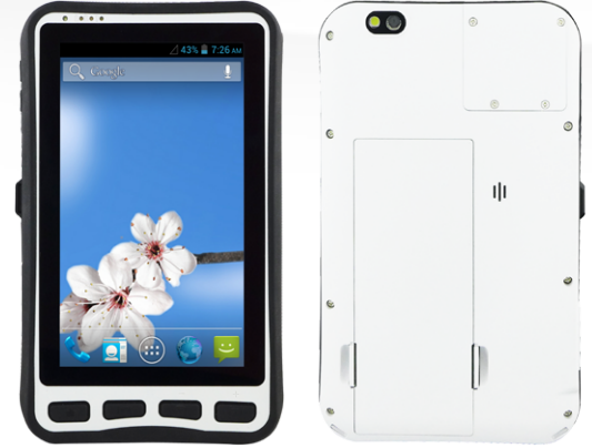
Optional With Barcode