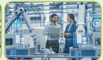
Industrial Process Control