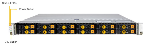
(Front View – System)