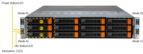
(Front View – System)