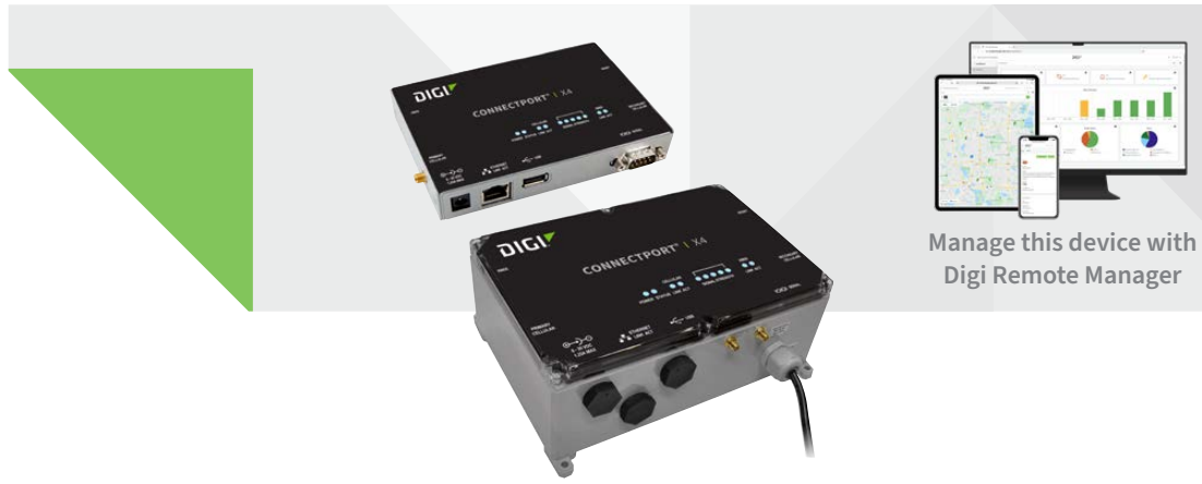
Manage this device with Digi Remote Manager